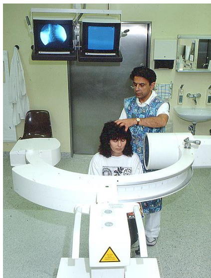
Fig.4 Functional study by C-arm

There are different preferred methods for diagnosing of C0/C1/C2 instability. We believe that functional study by fluoroscopy ( C-Arm ) can provide the best information and We have never made the final decision for surgery in lag of definite fluoroscopic evidences.