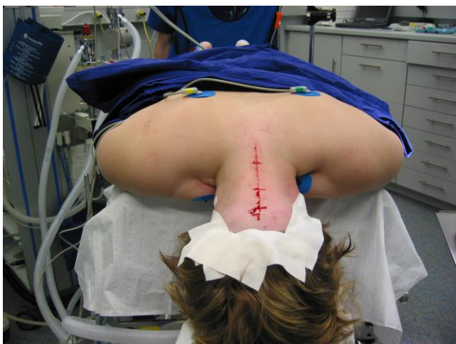
Fig.7 Midline incision

The incision was made along the dorsal midline passing over the cranio-cervical junction. The incision extended precisely in the midline along the linea nuchae from the occipital protuberance to the dorsal process of C 6 (Fig. 7).