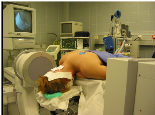
Fig.6 : Patient position

An x-ray monitor was draped and placed into position.