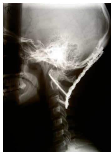
Fig.8 Post Op. X-ray

Here, I don't find it necessary to present the procedures of the surgery in detail.